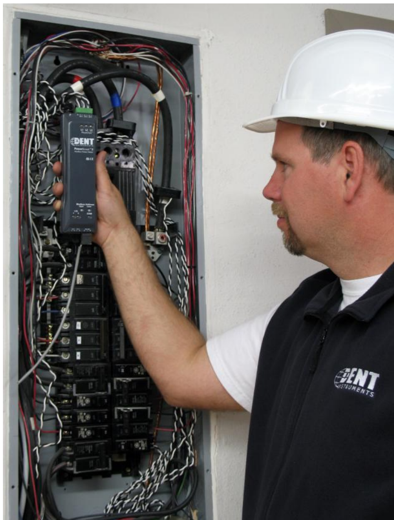
The Next Generation PowerScout™ 3 with Full Utility Metering™.